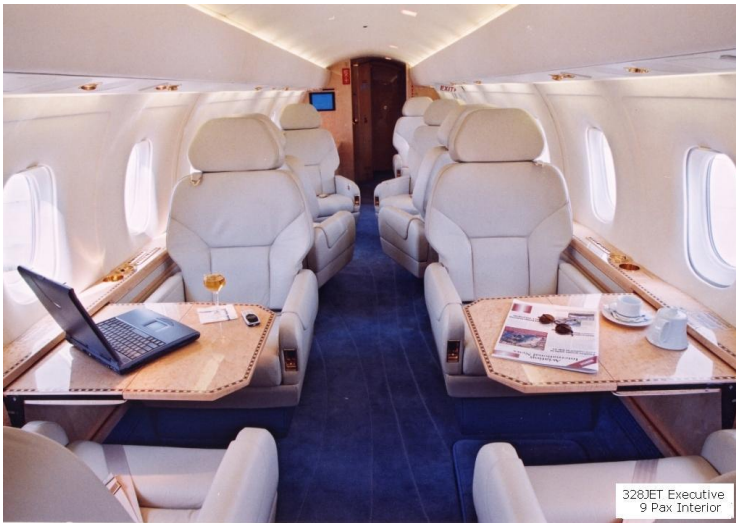
328JET Executive 9 Pax Interior