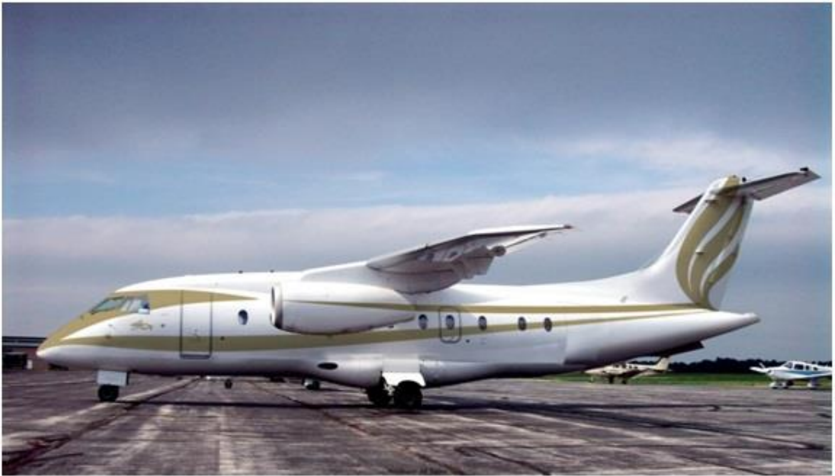
Dornier 328-300 ER